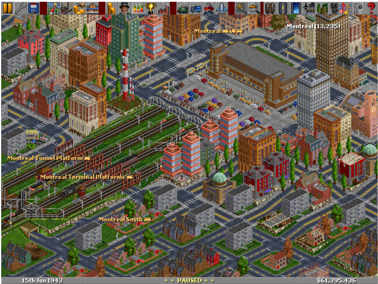
Gare Centrale, Montréal, Québec, Canada.